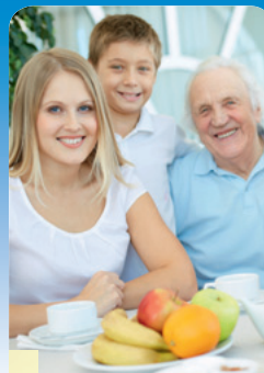
Food & Nutrition